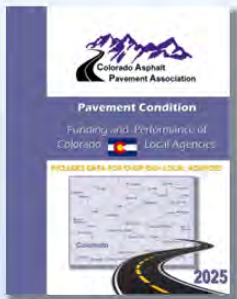
Complete Funding survey available on CAPA website

2025 Local Agency budgets indicate that approximately 55% of agencies have a reduction or no change in their budgets, while the other 45% have a slight increase from 2024. Funding across the state is flat, however, due to inflation, Program Delivery will decrease.