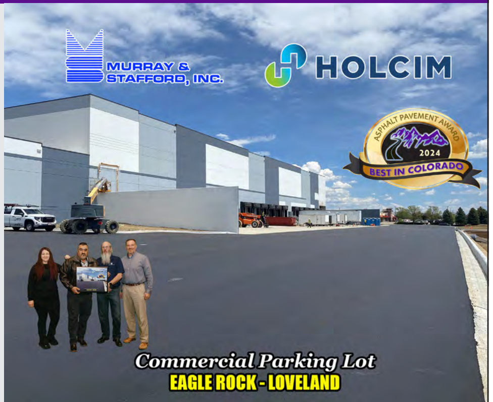
Commercial Parking Lot EAGLE ROCK - LOVELAND