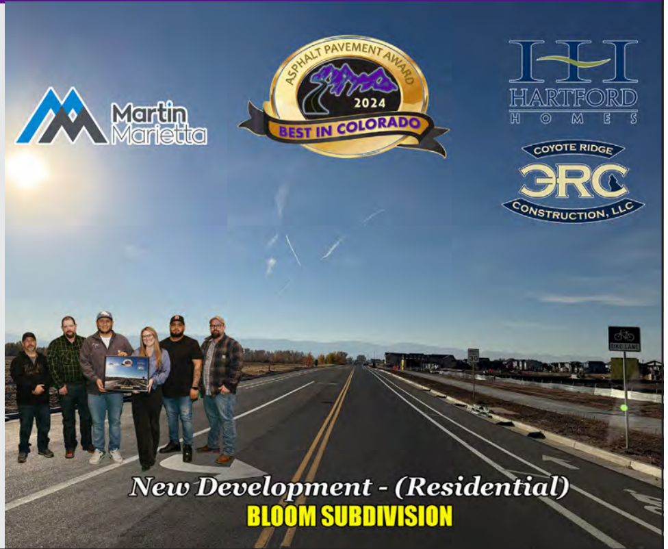
New Development - (Residential) BLOOM SUBDIVISION